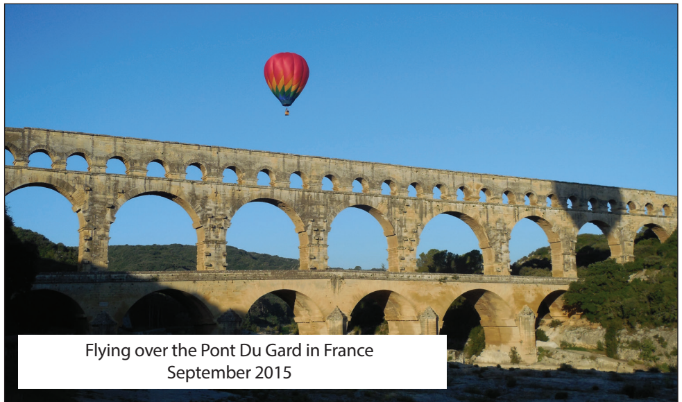
Flying over the Pont Du Gard in France September 2015

In order for an authorized individual to accept a student pilot application using IACRA, the authorized individual must be registered in