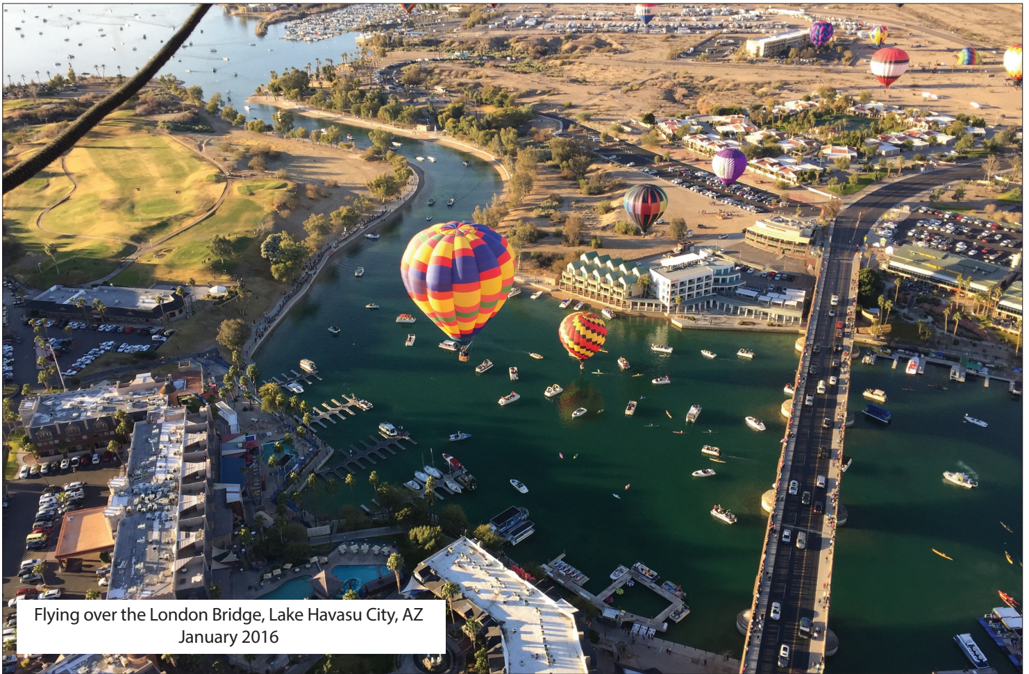
Flying over the London Bridge, Lake Havasu City, AZ January 2016