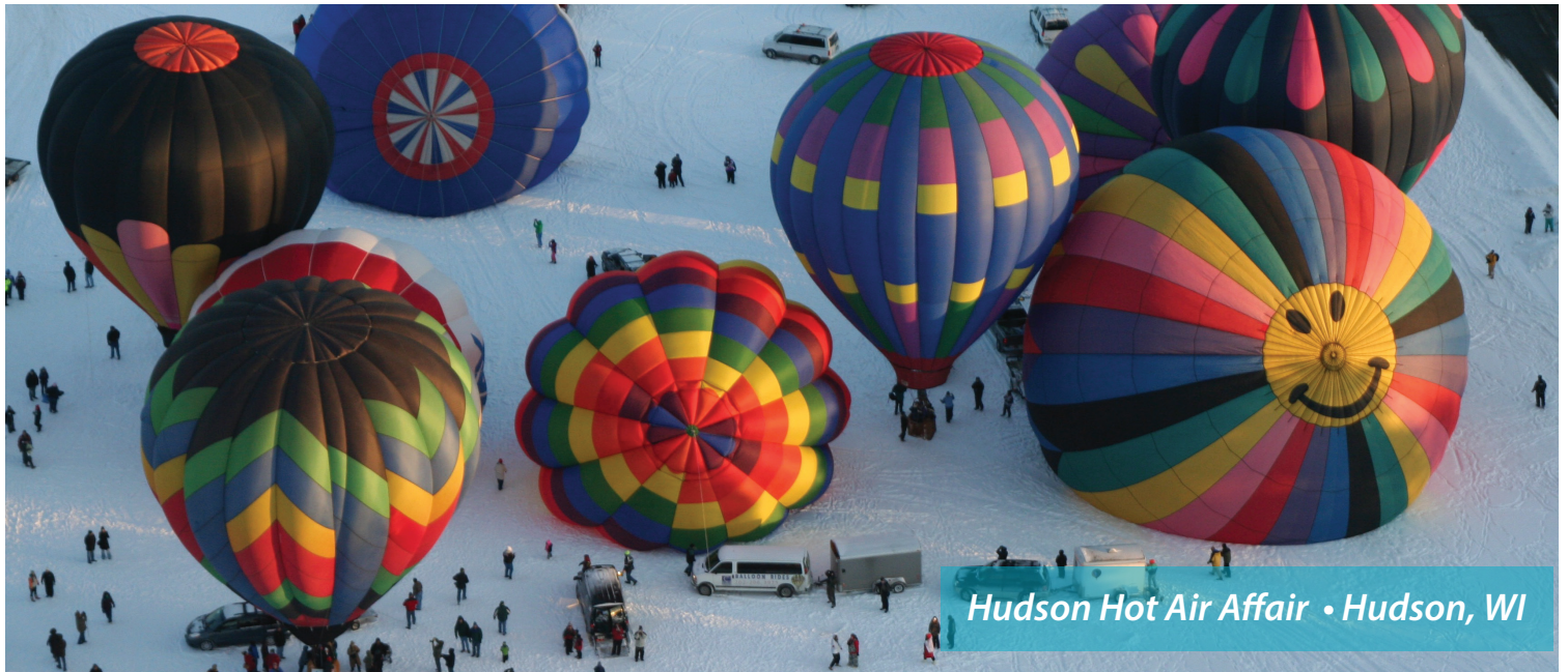
Hudson Hot Air Affair • Hudson, WI