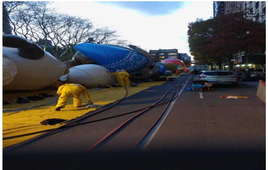
Inflation Team, almost ready for the parade!