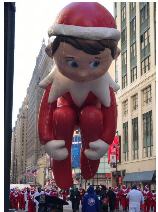
Where is your elf?