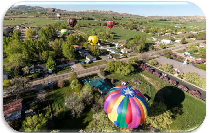
Dinah "Soar" Days & Hot Air Balloon Festival Vernal, Utah