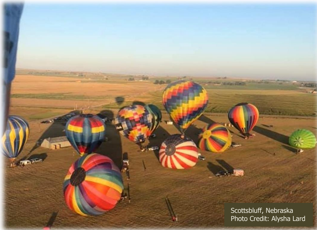
Scottsbluff, Nebraska