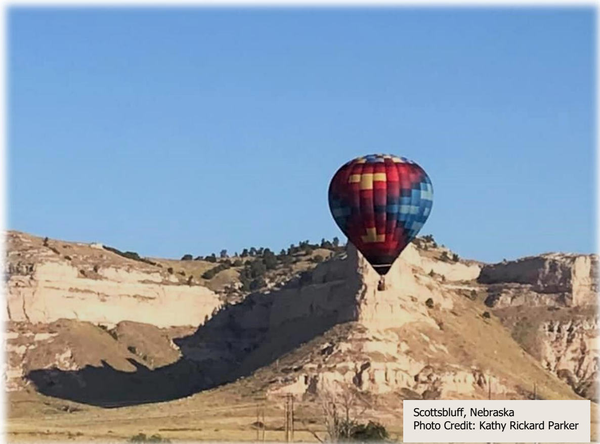
Scottsbluff, Nebraska

For more information in participating in the PAAP or the CAAP please go to: www.bfa.net under the education tab.