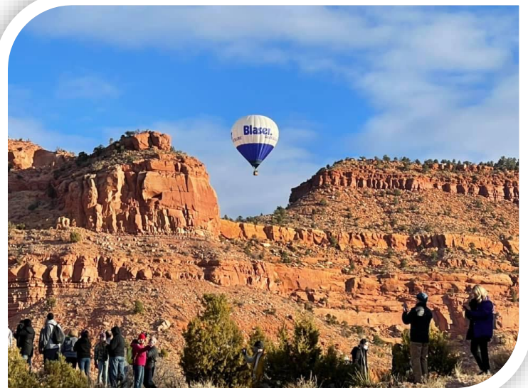
Both photos taken in Kanab, Utah