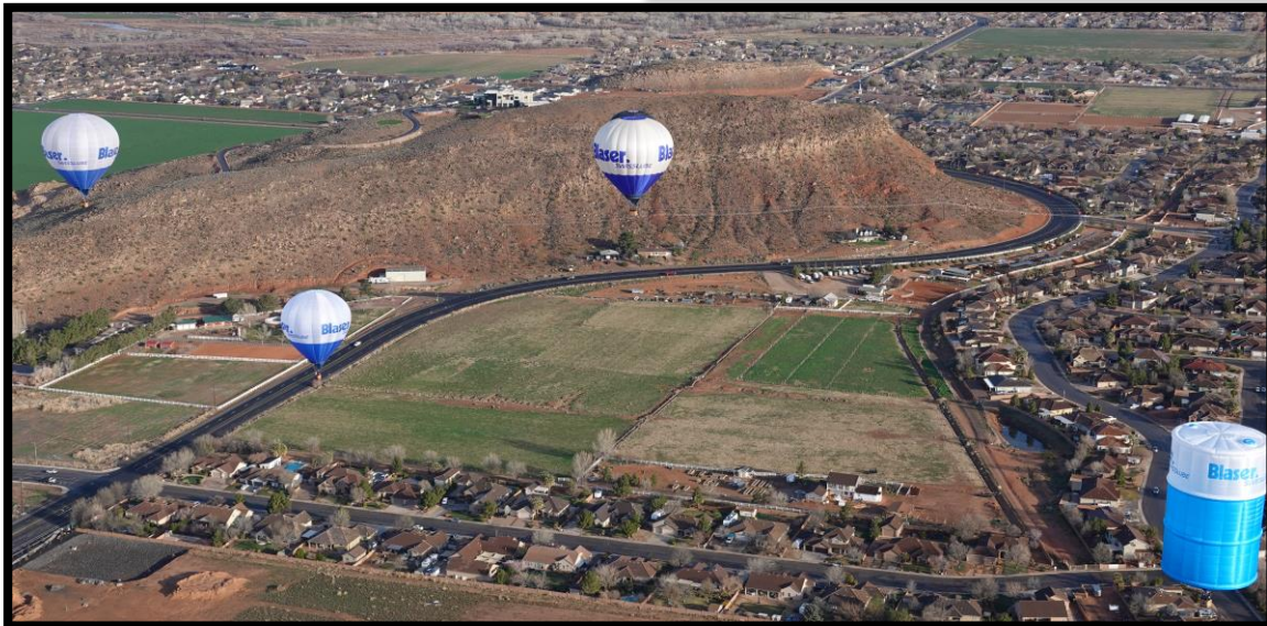
Blaser invited a large group of customers and wonderful pilots to fly the Blaser US fleet of five balloons in picturesque St. George, UT March 13, 2023