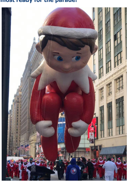
Where is your elf?