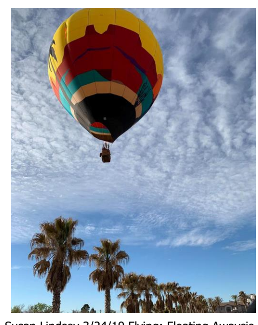
Susan Lindsey 3/24/19 Flying: Floating Awaysis