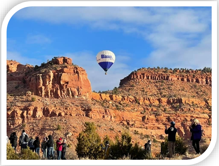
Both photos taken in Kanab, Utah